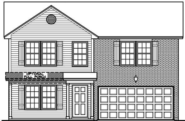
BRICK FRONT ELEVATION