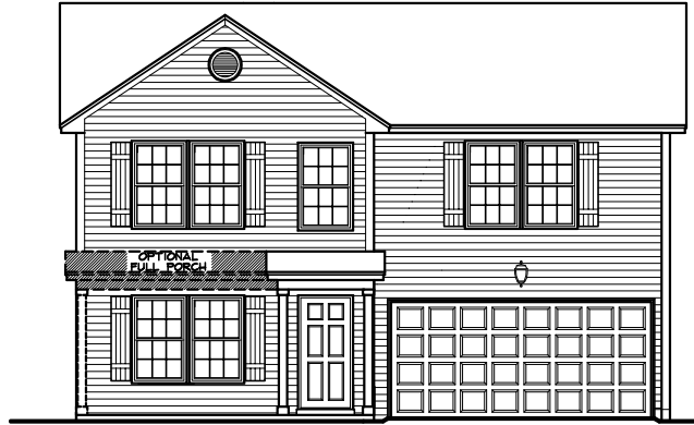
VINYL FRONT ELEVATION