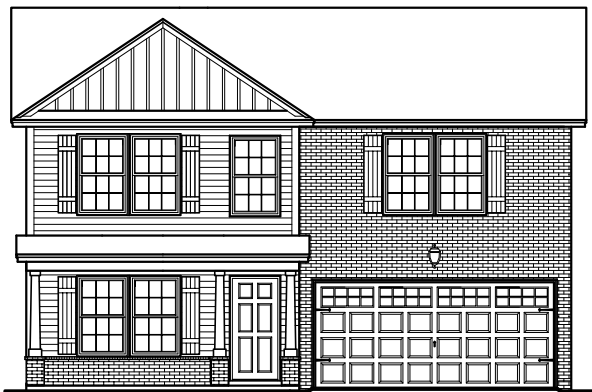
CARRIAGE FRONT ELEVATION