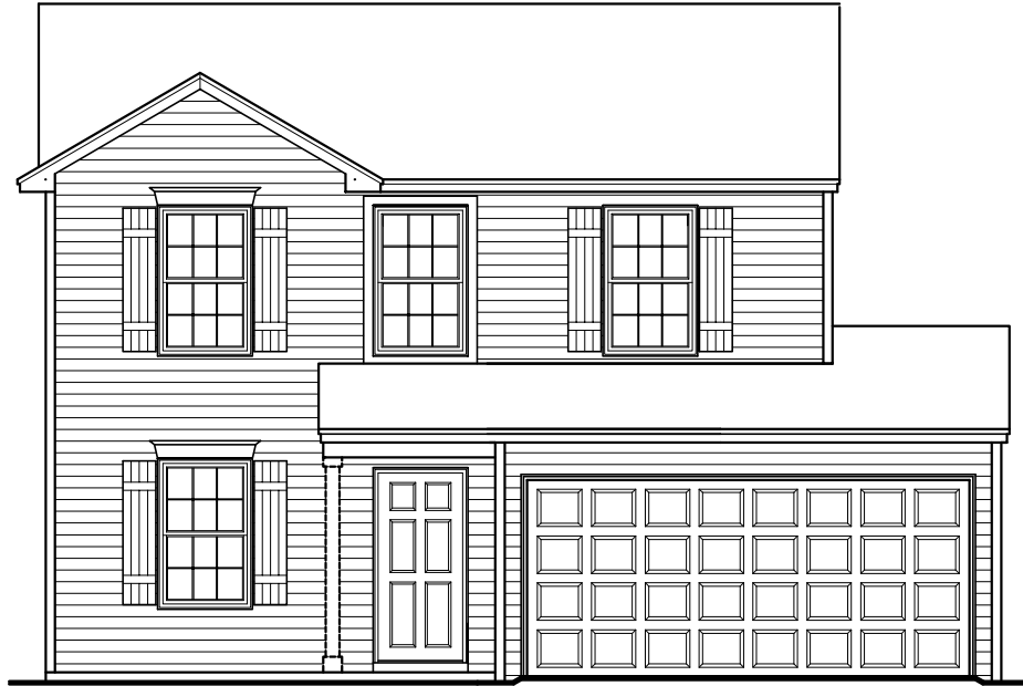
VINYL FRONT ELEVATION