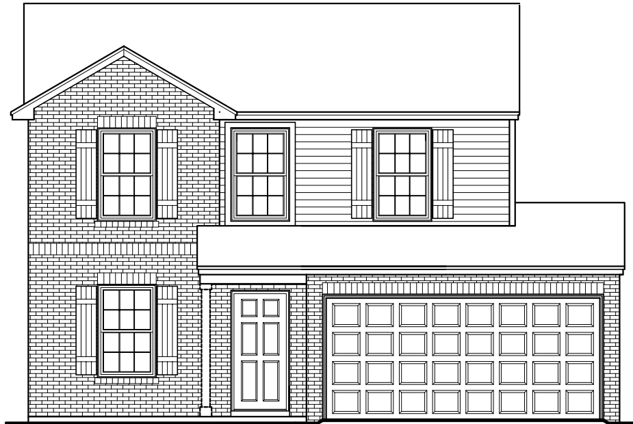
BRICK ACCENT ELEVATION